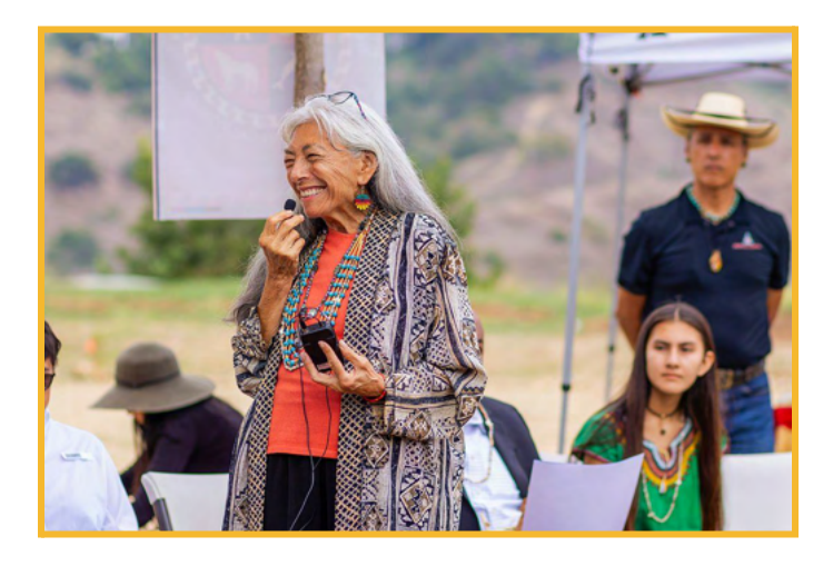
The Challenges of Creating Authentic Solidarity

Education and organizing is connected in our work. We work with families across the board concerning their lived realities. We address these lived realities in the school and through family organizing, parent organizing, and youth organizing. We ground our education and organizing in our relationship with the Earth and our relationship with ourselves, our past, and our vision for our future.